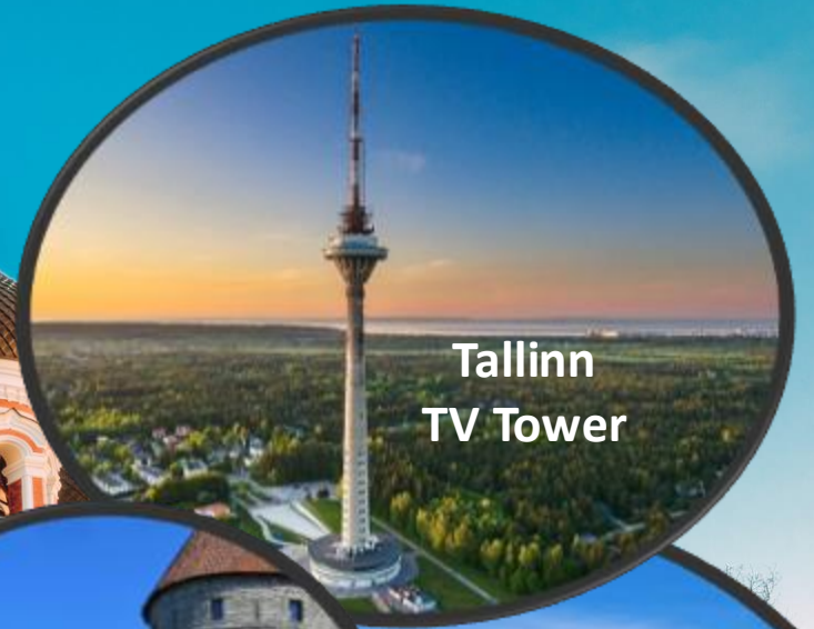
Tallinn TV Tower