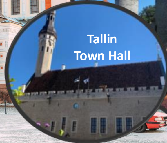
Tallin Town Hall