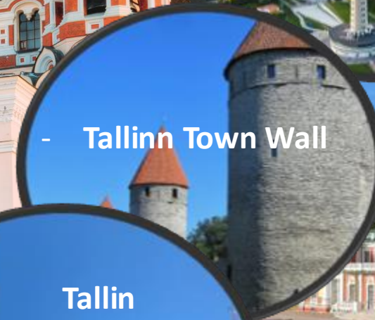
- Tallinn Town Wall